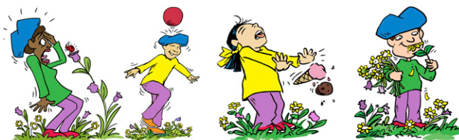
Fig. 3. Sample Illustrations.

Given the pernicious consequences of social essentialism, elucidating the processes underlying its development is a critical goal. Indeed, in study 3, parents who were induced to hold essentialist beliefs about Zarpies were more likely to produce negative evaluative statements about them. Thus, these data suggest that inducing essentialism may contribute to negative social attitudes (13, 16, 38–40). Understanding the mechanisms that underlie the development of social essentialism could provide guidance on how to disrupt these processes, and thus perhaps on how to